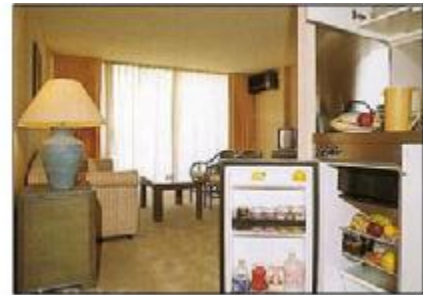
L-R Exterior, Moderate Room, Kitchenette Facilities